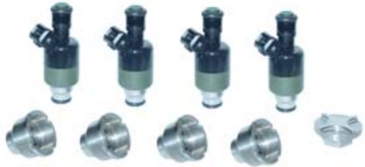
APR Injectors with Seats and Special Tool